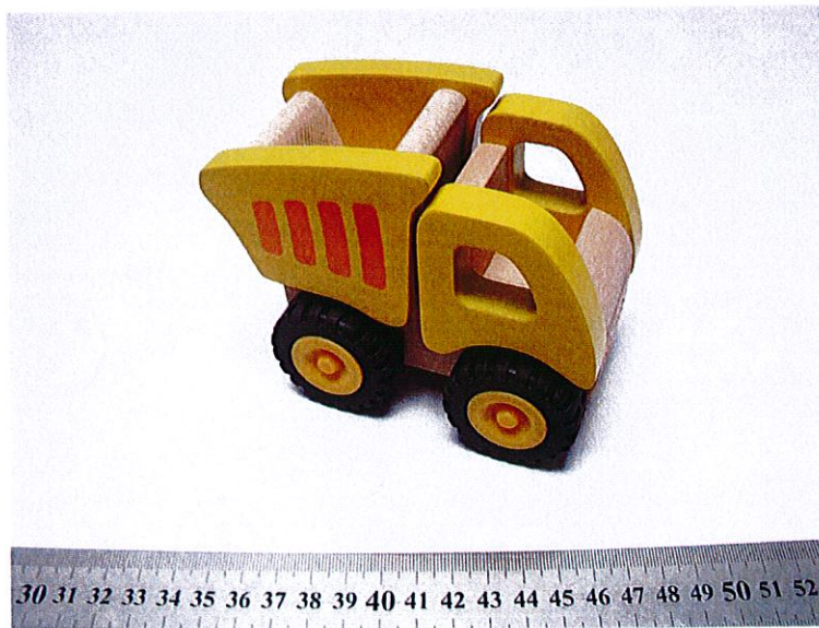
Photo of the sample